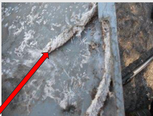
Asbestos Rope seals