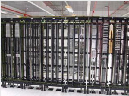
MDF (Main Distribution Frame) (CM120RTK0002) Used to manage main cable terminations, for example where external cables enter an operational building

If equipment is working generally cable distribution frames are not inspected and are not checked directly, only if there are known issues or prior to upgrading projects.